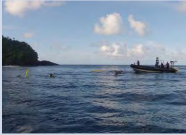
Marine Patrol responds to divers in distress