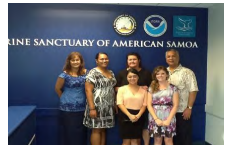
Outreach to Tafuna High School