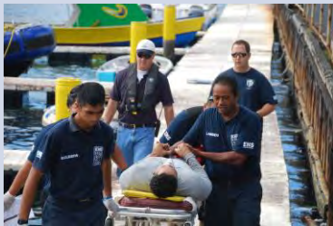
EMS transports divers