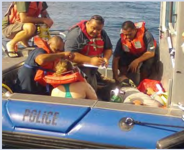
Marine Patrol conducts initial assessment of diving injuries